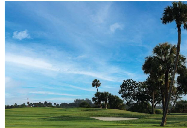
Tee times may be blocked for approved tournament or league play only.